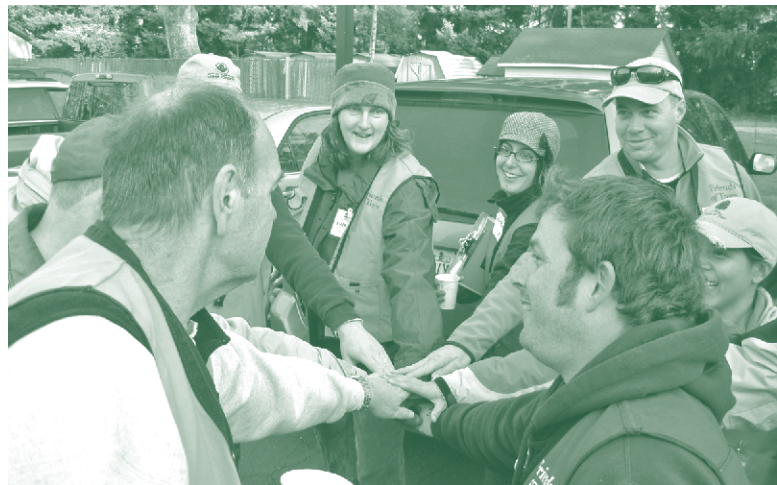
Volunteer crew leaders rallying before a Neighborhood Trees planting.

Our program’s success during the 2009–10 season could be measured each weekend by the neighborhood coordinators, crew leaders, and planting volunteers who showed up regardless of the weather to improve the region’s neighborhoods and green spaces. The number of volunteers grew ten percent over the previous year, to 2,105, and total hours contributed grew 29 percent, to 23,624 hours.